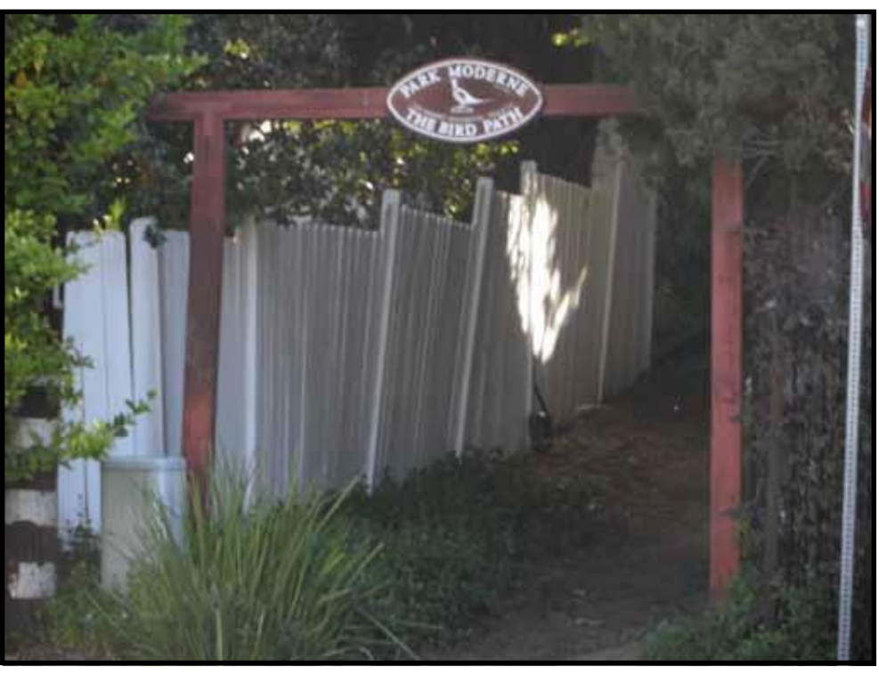
Above: Entrance to the Bird Path on Blackbird Way

Between Bluebird Drive and Blackbird Way Calabasas Historic Landmark No. 5