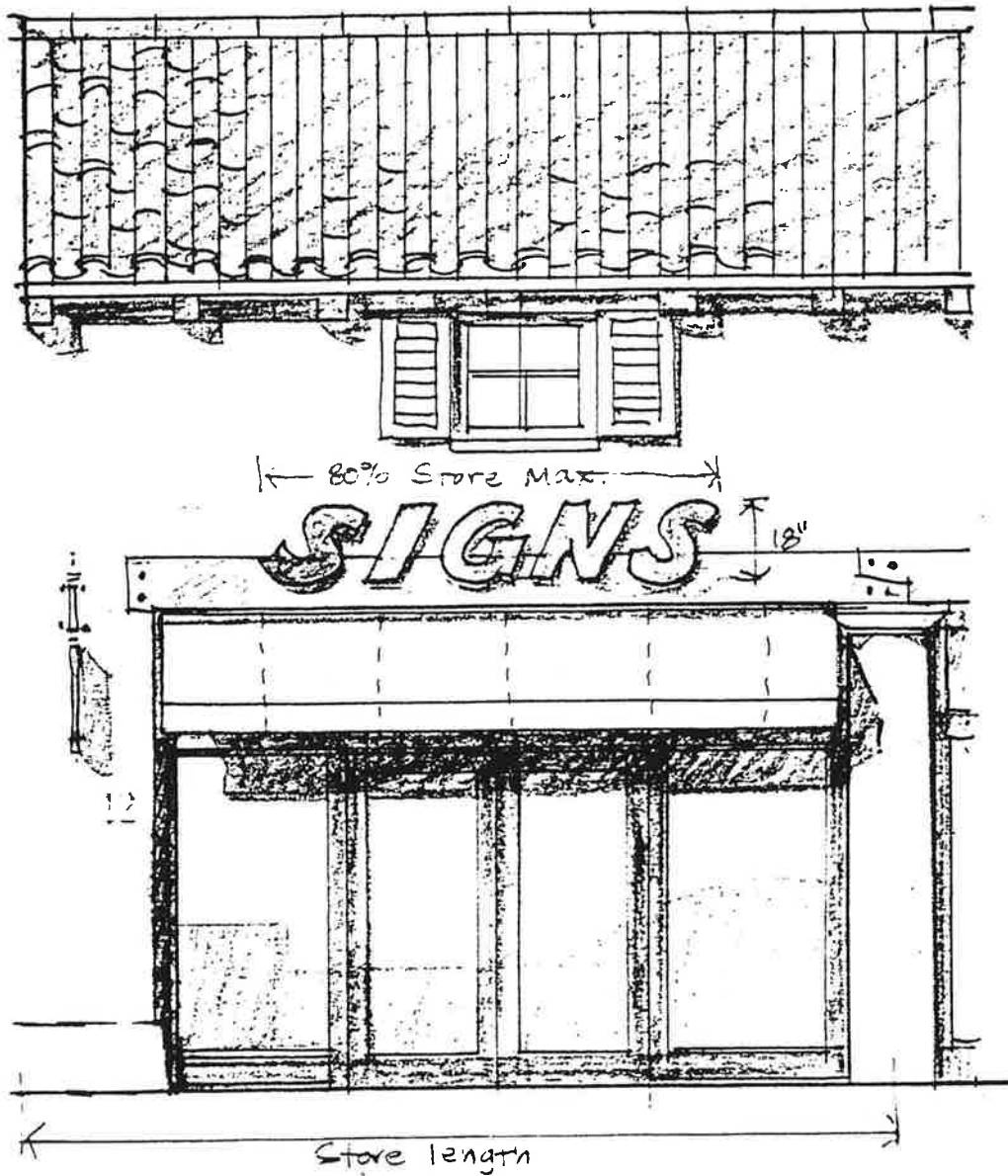
MINOR TENANT SIGN