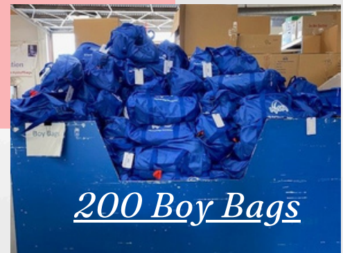
200 Boy Bags