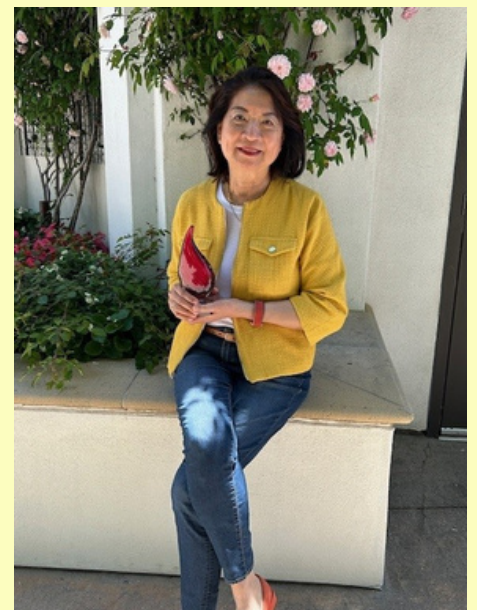
Volunteer of the Year 2024