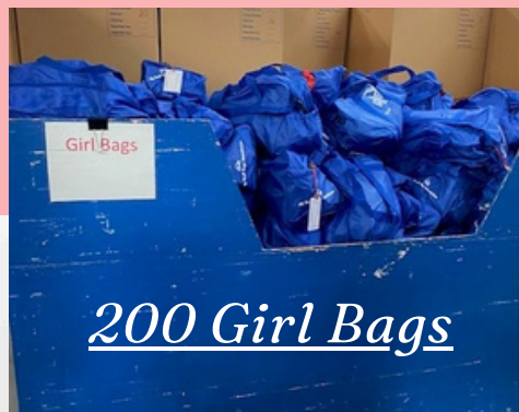
200 Girl Bags