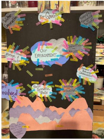
Adult Poster - outlining most important issue and zip code