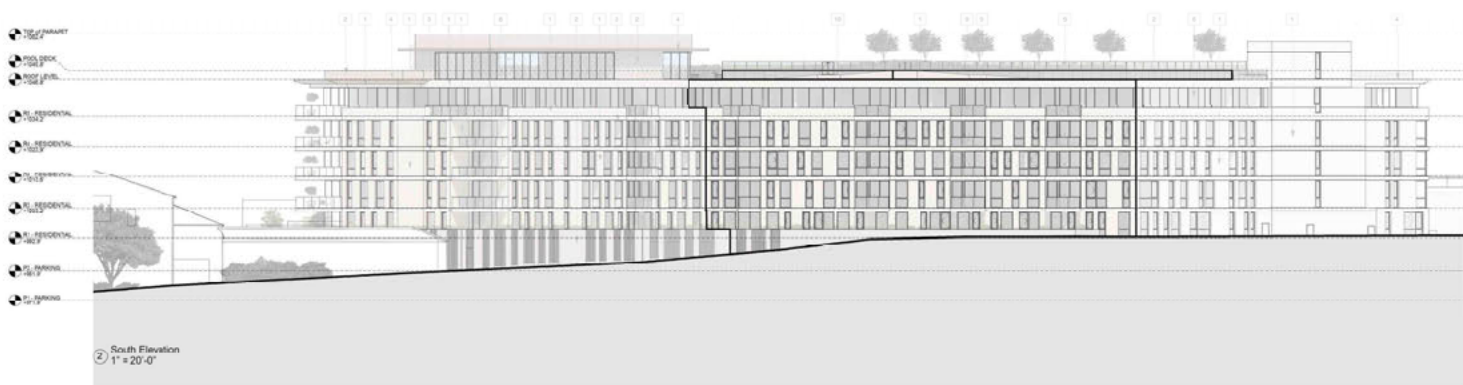
2 South Elevation 1" = 20'-0"