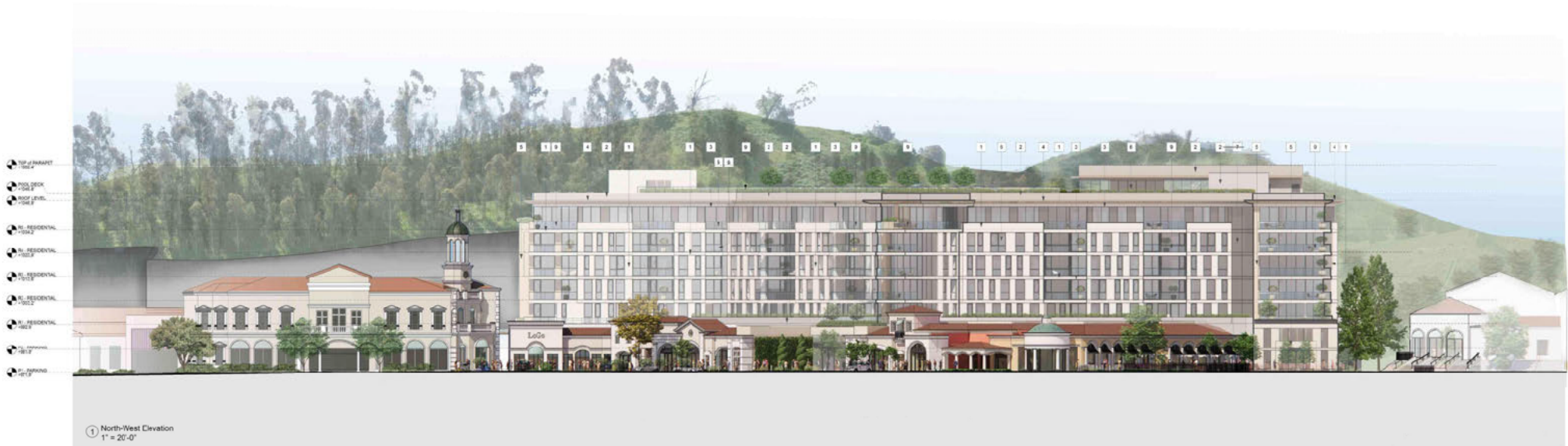
1 North-West Elevation 1" = 20'-0"