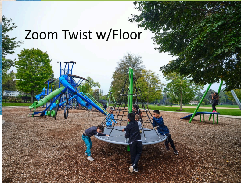
Zoom Twist w/Floor