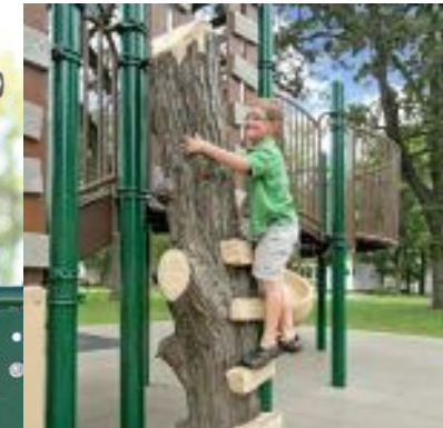
Tree Climb & Treehouse Panel