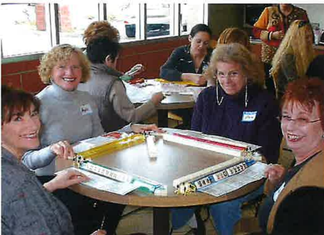
EVALUATION OF CURRENT INDOOR PROGRAMMING Will reveal how well the needs of all generations of the community are currently met at the Agoura Hills/Calabasas Community Center.

With a shared understanding of programs and facilities in existence in the service area and what are best practices and benchmark standards among peer cities, we are able to effectively engage with city staff and the community in an effort to understand first the "wish list"--or "gap analysis"