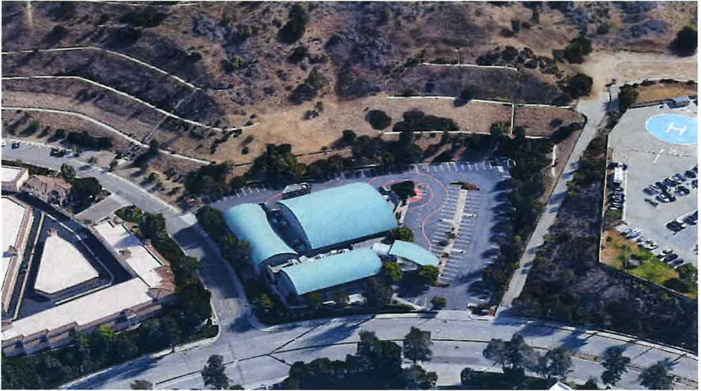
AGOURA HILLS CALABASAS COMMUNITY CENTER The existing site presents untapped opportunities for expansion and diversification of indoor facilities.