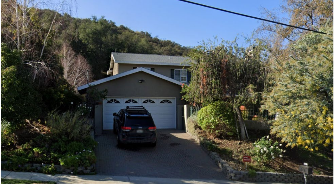
VIEW OF EXISTING RESIDENCE – 3821 EDDINGHAM AVE