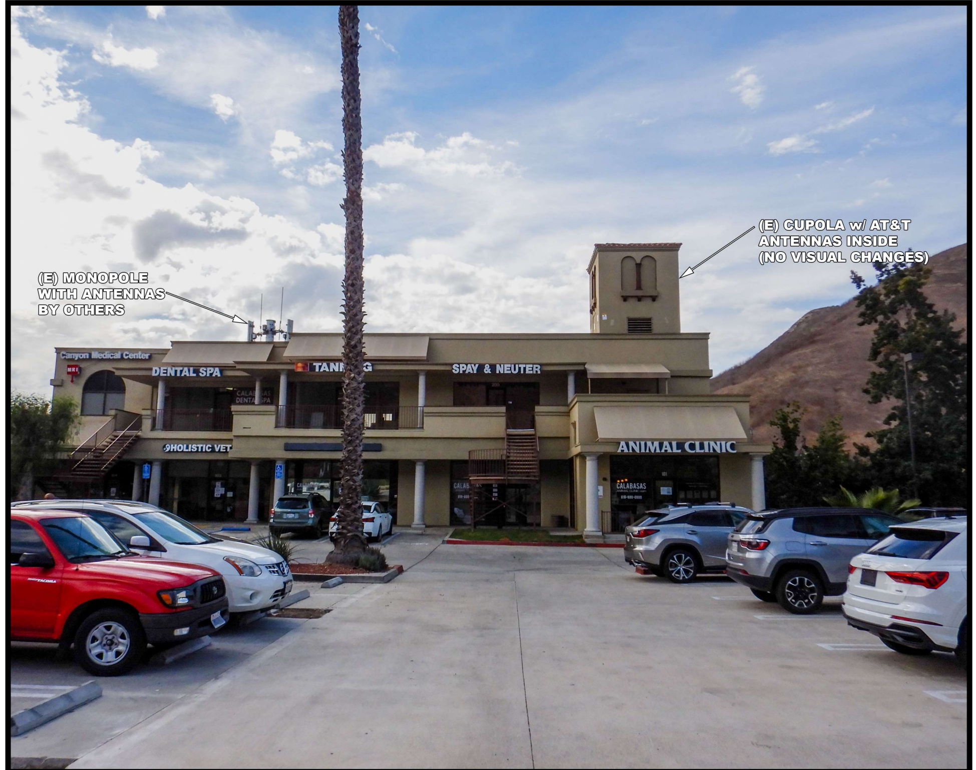
VIEW FROM EAST OF (E) BUILDING