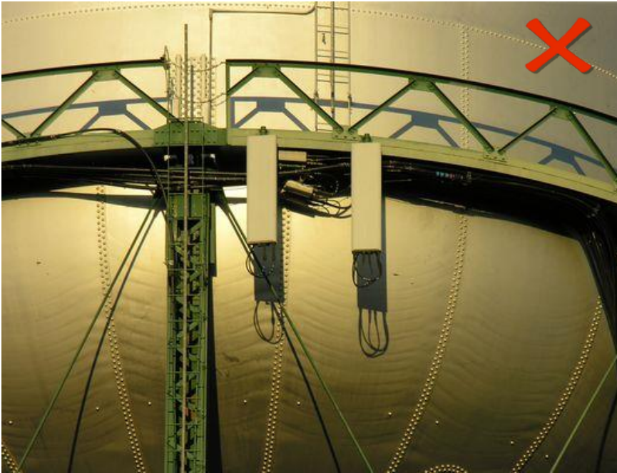
Figure 18: Unsuccessful example outside Calabasas; equipment not screened. For non Right-of-Way sites, all equipment shall be screened from view in order to be considered a Tier 1 facility.

Facilities located on public agency's properties include but aren't limited to: water tanks facilities, park facilities, and fire station facilities. Public agency facilities might also fall under previously mentioned categories (such as a flag pole in front of a fire station), but these facilities can also include collocated facilities around a water tank or a standalone structure at a park. As with previously mentioned Non Public Right-of-Way facilities, all antennas and equipment must be screened from public view in order to be considered a Tier 1 facility, and must also be compatible with design and scale of surrounding area.