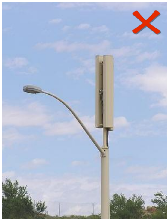
Figure 22: Unsuccessful example outside Calabasas; not concealed, wiring and antennas still visible.