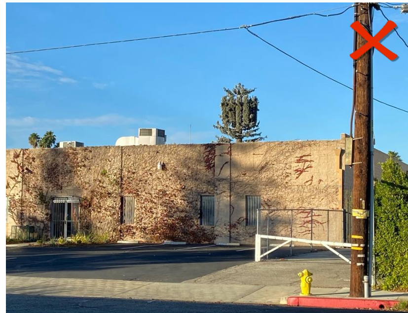
Figure 11: Unsuccessful example outside Calabasas; tree design adequately screens antennas, but the facility does not blend in with surrounding environment.