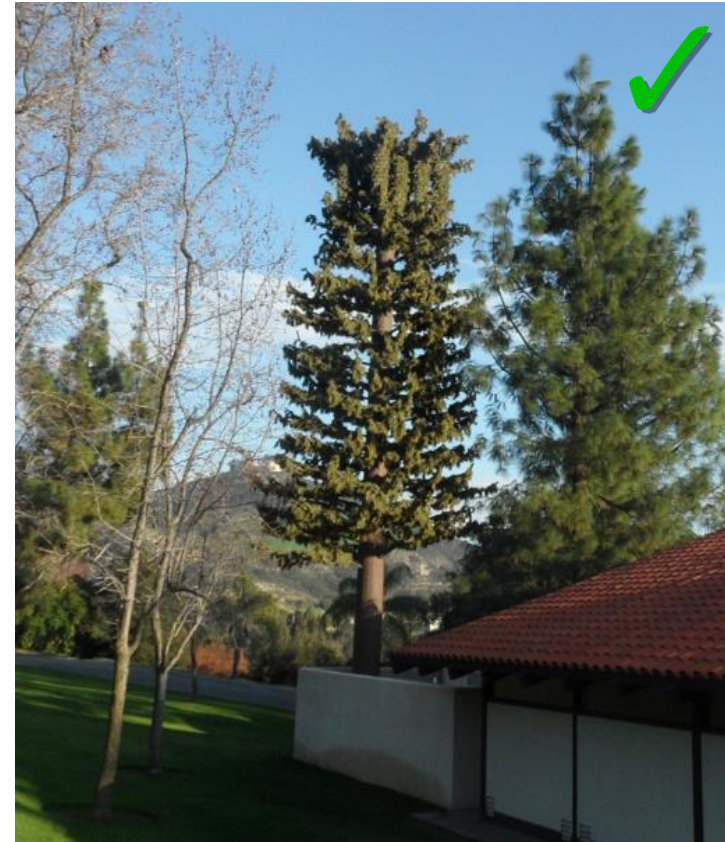
Figure 13: Successful example in Calabasas; faux tree species is compatible with surroundings and antennas are properly camouflaged.