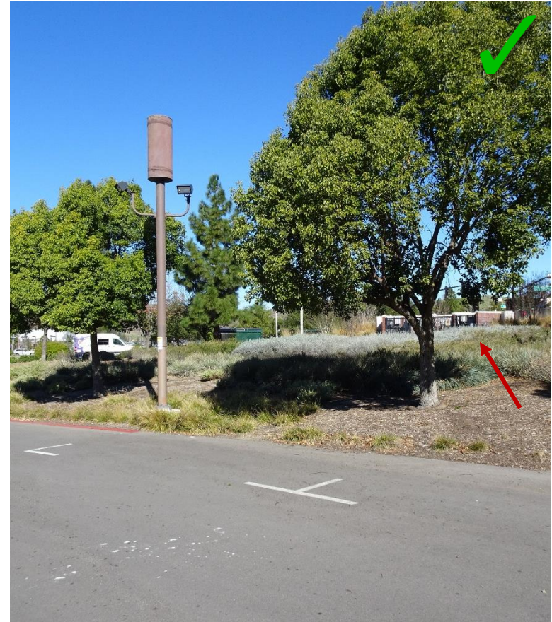
Figure 17: Successful example outside Calabasas; all antennas contained within radome and ground mounted equipment is screened (see red arrow), compatible in scale with surroundings.