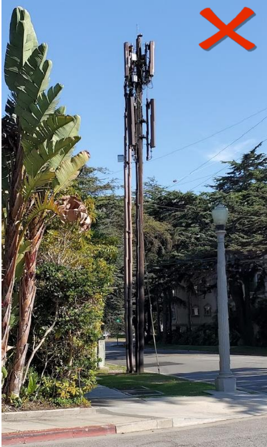
Figure 28: Unsuccessful example from outside Calabasas; equipment/antennas not screened to the maximum extent feasible, visible wiring.