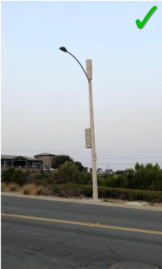
Figure 25: Successful example outside Calabasas; equipment and antennas concealed, no ground mounted equipment.