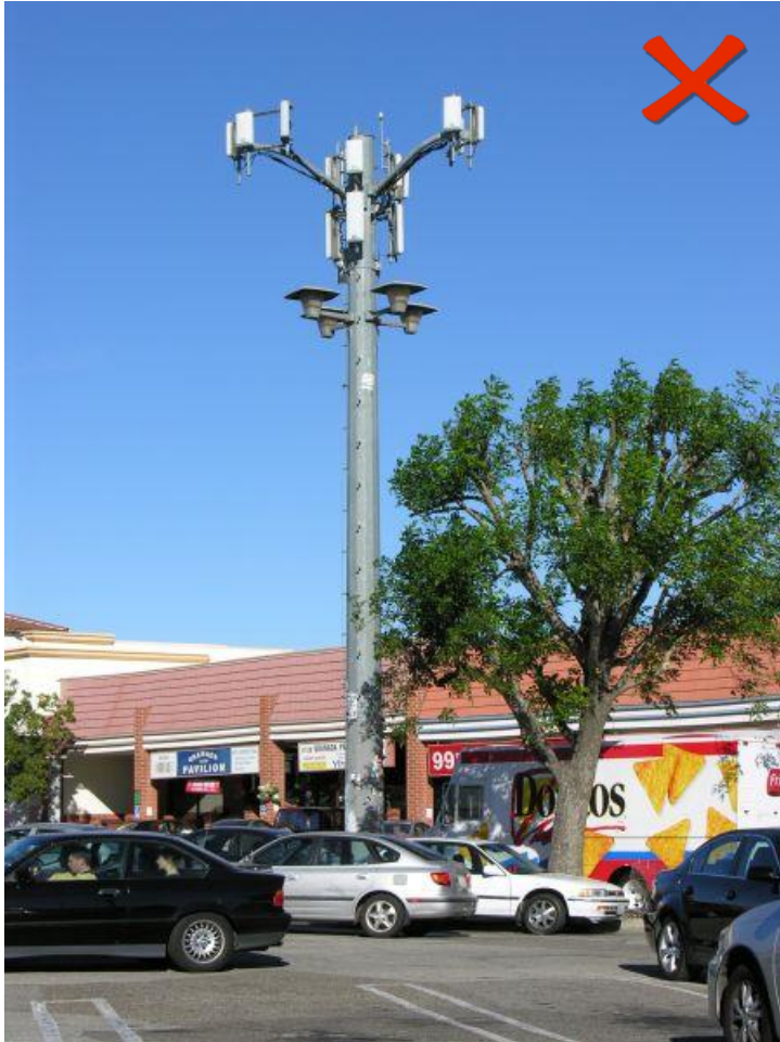
Figure 16: Unsuccessful example outside Calabasas; facility not camouflaged, pole not compatible in size or scale with surroundings.