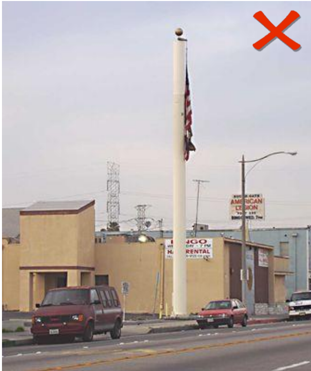
Figure 14: Unsuccessful example outside Calabasas; although facility is camouflaged, pole is not compatible in size (both height and diameter) or scale with surroundings.

Pole-mounted facilities not located in the Right-of-Way can take many forms, but the most commonly observed are facilities mounted to light standards and flag poles. Design of these facilities should take into consideration the surrounding context to determine what type of pole-mounted facility design would be best suited for a particular location. All pole-mounted facilities shall be compatible in size, scale, and style with the surrounding area—especially for facilities located among other poles (multiple flag poles, light standards in a parking lot) the wireless facility shall be designed to be relatively consistent with other poles in the vicinity in order to be properly camouflaged. Facilities and associated pole shall be kept in good condition.