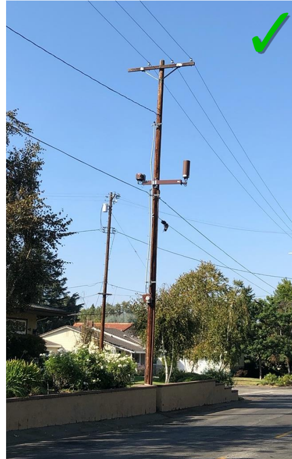
Figure 29: Successful example from outside Calabasas; all equipment and antennas concealed and painted to match pole.