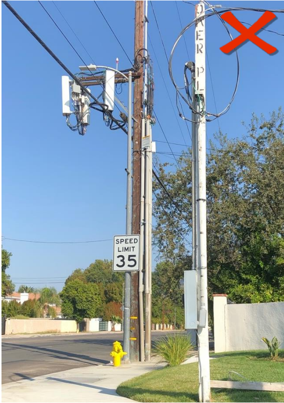
Figure 30: Unsuccessful example outside Calabasas; equipment and visible antennas too large, and not painted to match pole.