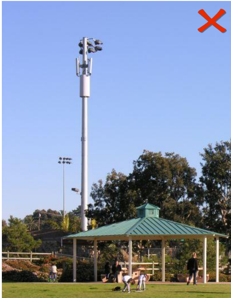
Figure 20: Unsuccessful example at a park outside Calabasas; equipment not fully screened, antennas still visible. Does not meet the classification of a stealth facility not located in the Right-of-Way.