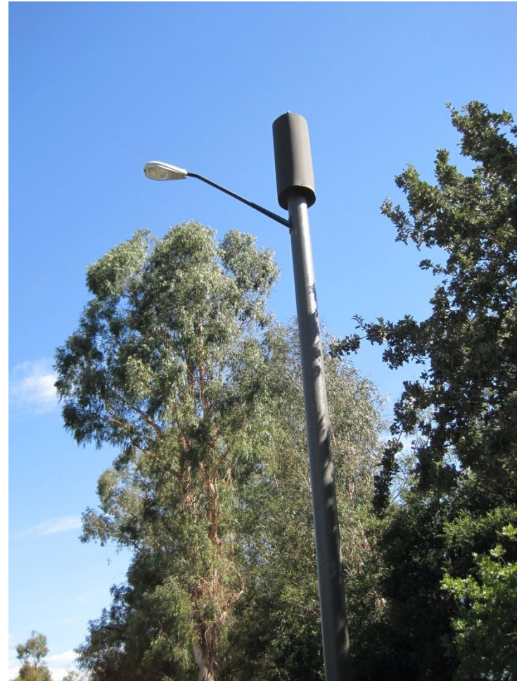
Figure 1: Example of stealth facility in Calabasas, mounted to light pole in Public Right-of-Way.

Additional information on both private property & Public Right-Of-Way facilities’ requirements to be considered a Tier 1 facility are expanded upon in greater detail in the below sections. Tier 1 wireless facilities, whether located on private property or within the Public Right-of-Way, must be designed as stealth facilities and must meet the review criteria identified above as well as all the requirements of the Calabasas Municipal Code. If the review criteria above cannot be met, the facility will then be considered a ‘Tier 2’ facility and must follow the requirements set forth in Section 17.31.050 of the Municipal Code. In all cases, facilities are subject to review by the appropriate City review authority.