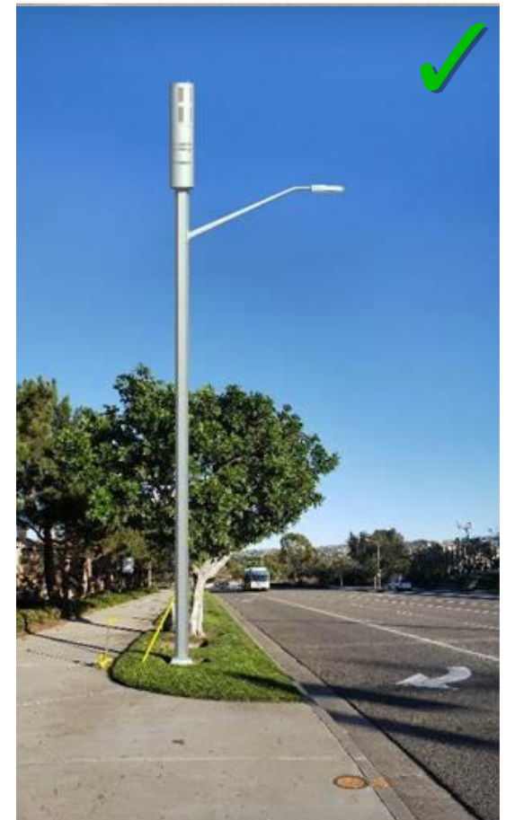
Figure 27: Successful example outside Calabasas; equipment and antennas concealed, no ground mounted equipment.