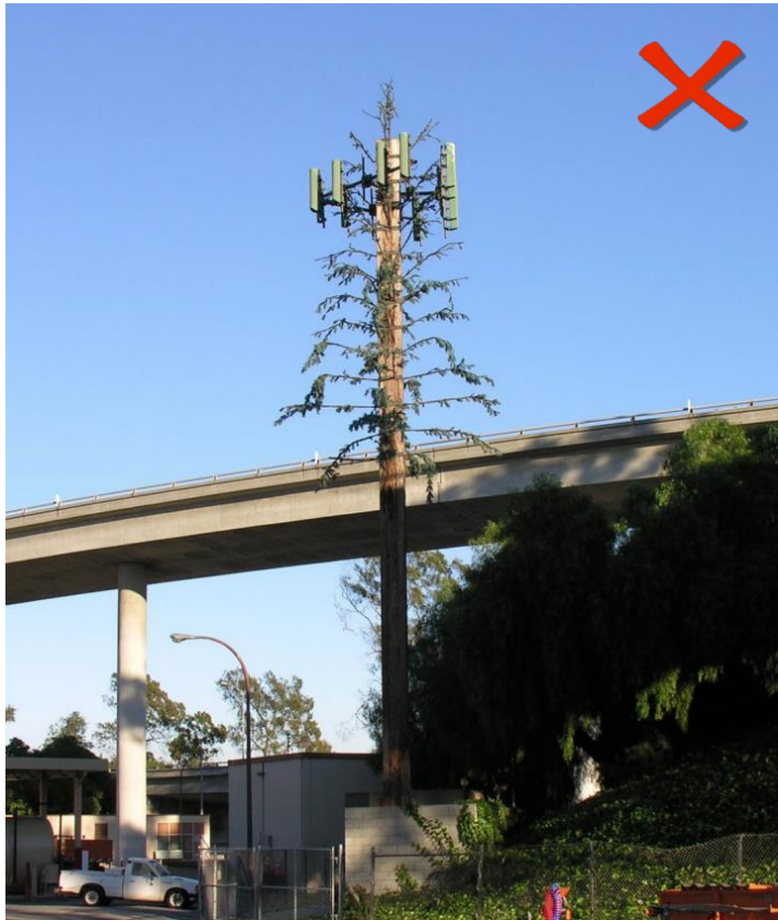
Figure 10: Unsuccessful example outside Calabasas; does not blend in with surroundings and poor tree design.

Faux trees are effectively a tower facility designed to closely and naturally resemble a tree. Design of these facilities should include an assessment of the appropriate tree species based on the surrounding area, shape, and size, as well as the quality and longevity of materials (branches & bark), color, and finish in consideration of the facilities' surroundings. Detailed specifications must be provided during plan review. Both tree design and placement (e.g., surrounding context) will be taken into consideration when reviewing faux tree facilities.