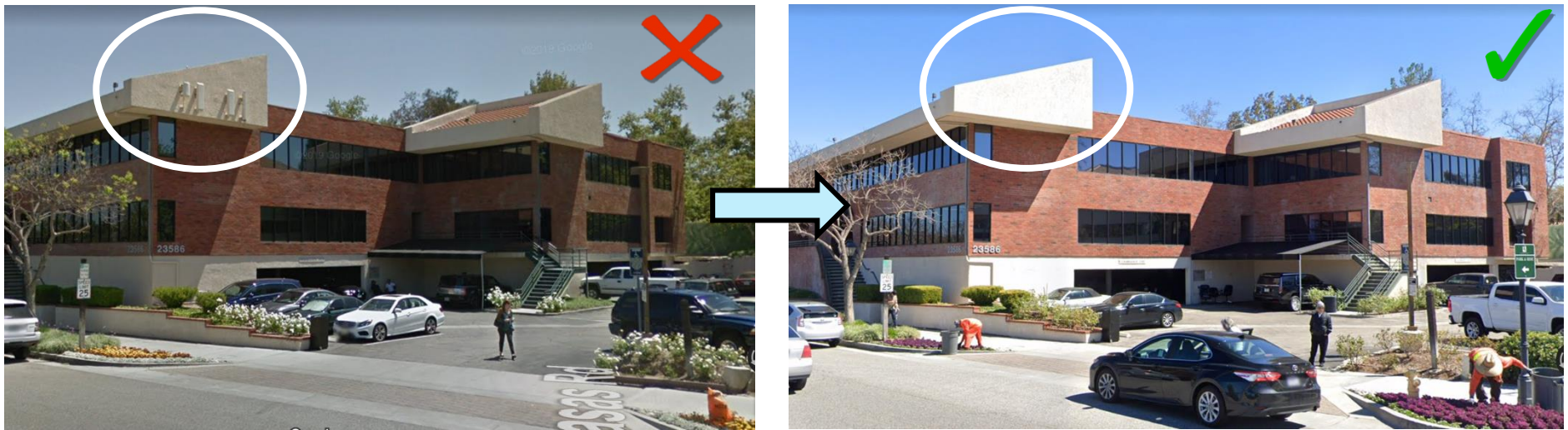
Figures 2 & 3: Before-and-after images showing successful faux façade element constructed out of fiberglass to screen existing antennas.

Façade mounted facilities are facilities which include antennas mounted, attached, or affixed to any façade of a building. Successful stealth façade-mounted facilities shall have all antennas and equipment screened from public view, through the use of fiberglass panels or other elements that blend in with the existing façade. The examples below illustrate successful and unsuccessful façade-mounted facility designs.