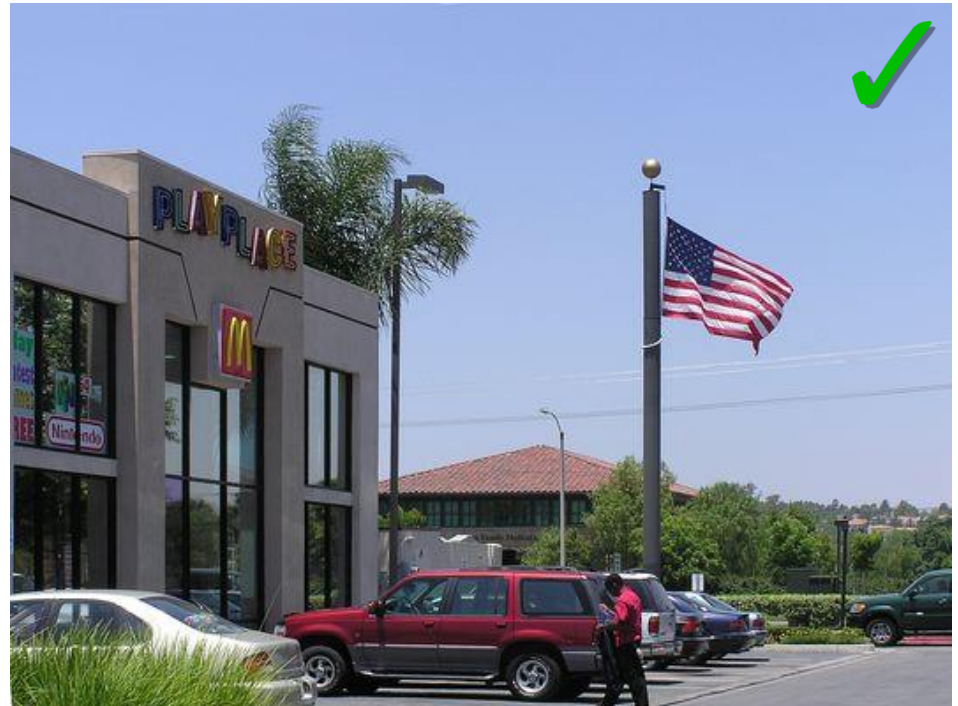
Figure 15: Successful example outside Calabasas; pole is compatible with surroundings in scale and design, and facility is properly camouflaged.