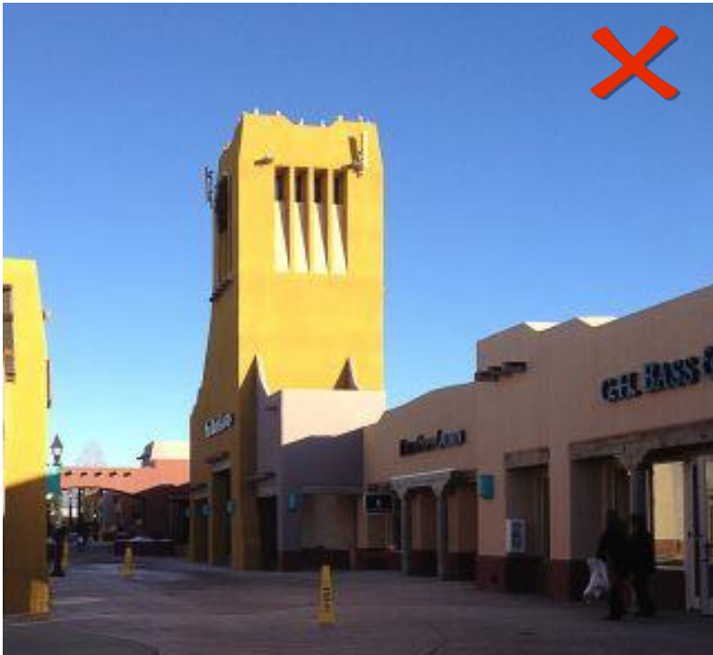
Figure 8: Unsuccessful example outside Calabasas; antennas mounted on the facade of the tower feature rather than inside the feature, and the tower feature itself is not compatible in scale or design with surrounding context.

Architectural elements/Tower facilities are stealth facilities enclosed entirely within a feature that is proposed to be fully integrated and architecturally compatible with the surrounding context at the site. These facilities include clock towers, bell towers, steeples, art in public places, or similar features. Successful facilities shall locate all antennas and equipment entirely within these features (not mounted to the outside), and the feature shall be compatible in size, scale, and architectural style with the structure it is mounted to as well as its surroundings.