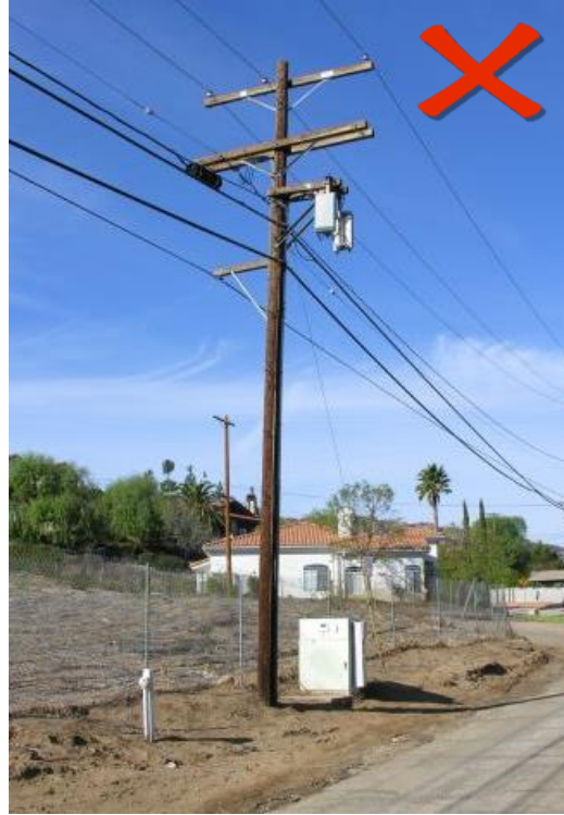
Figure 31: Unsuccessful example outside Calabasas; antennas and ground mounted equipment are not camouflaged through use of paint to match pole.