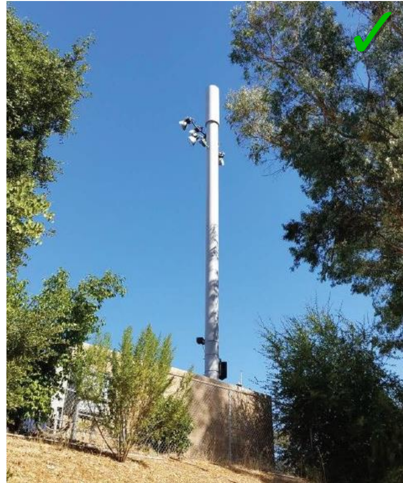
Figure 21: Successful example from facility at Calabasas High School; all equipment screened, and radome camouflaged to match pole.