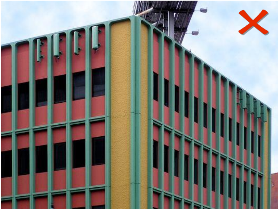
Figure 6: Unsuccessful example outside Calabasas; antennas are painted to match building elements but are not fully screened/camouflaged. Would not be considered a stealth facility.