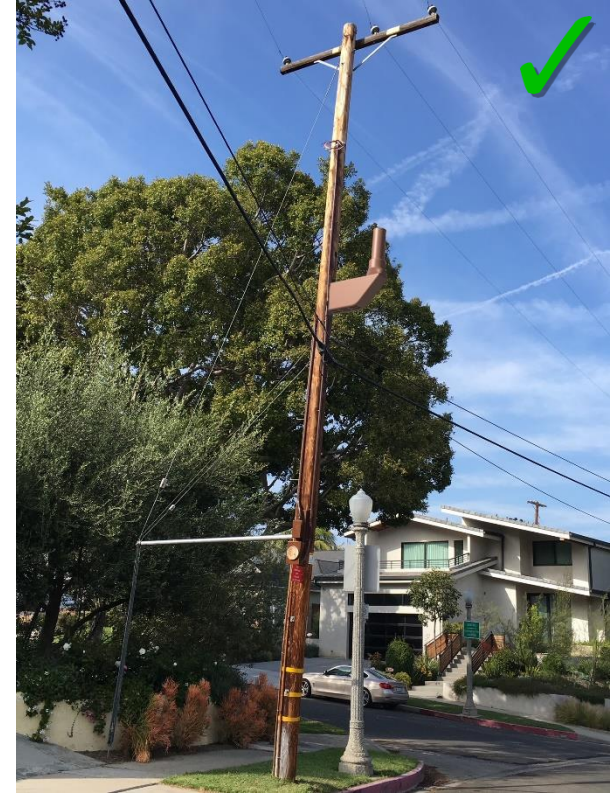
Figure 32: Successful example outside Calabasas; equipment is minimal, and painted to match pole.