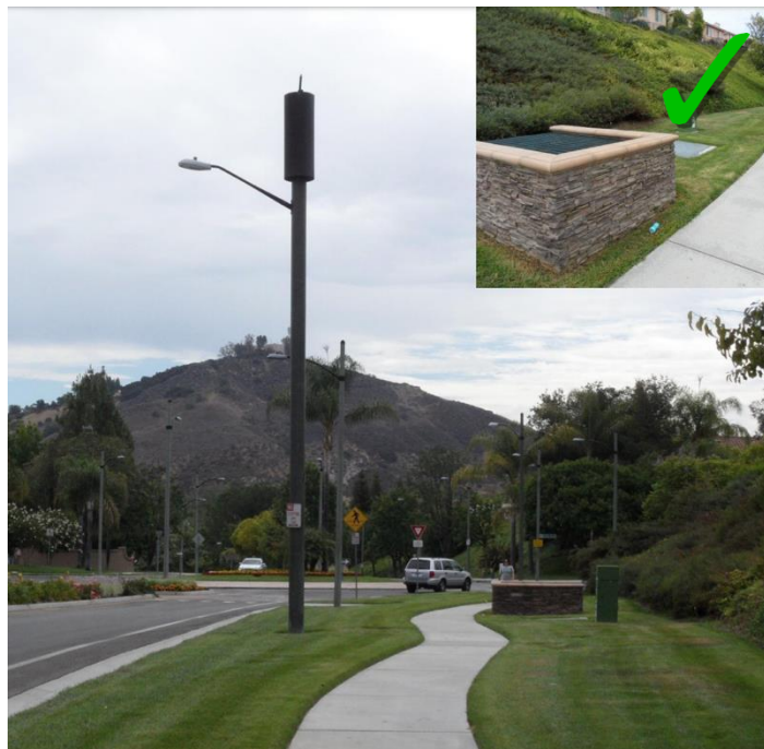
Figure 23: Successful example in Calabasas; equipment concealed within radome ground mounted equipment screened behind rock wall enclosure.