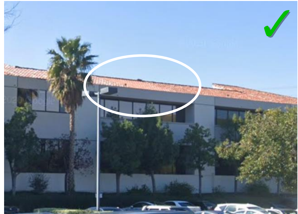
Figure 7: Successful example in Calabasas; faux roof tile element screening facility located on top of the building. Design closely matches surrounding tiles.