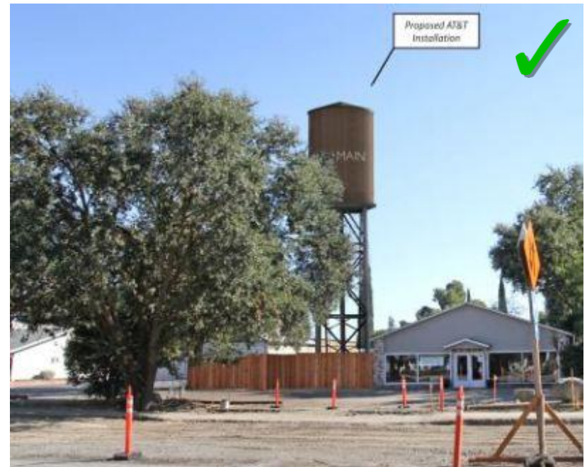
Figure 19: Successful rendering from project outside Calabasas; all equipment screened within faux water tank.