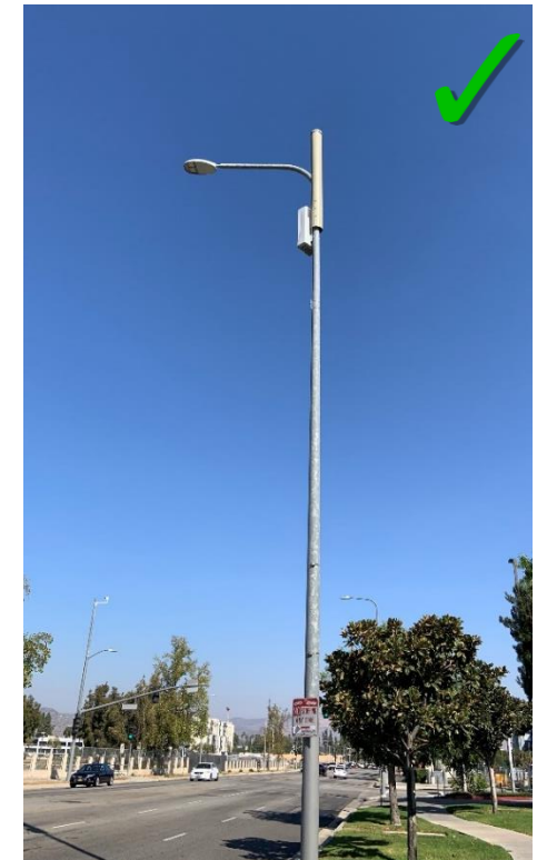
Figure 24: Successful example outside Calabasas; equipment and antennas concealed.