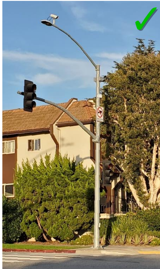
Figure 26 Successful example outside Calabasas; minimal pole mounted equipment, no ground mounted equipment.