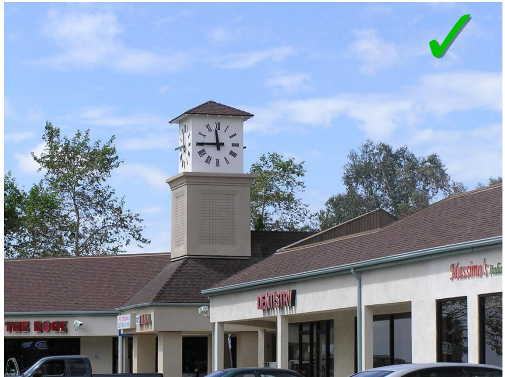
Figure 9: Successful example outside Calabasas; all equipment concealed within feature and is architecturally compatible with existing roof.