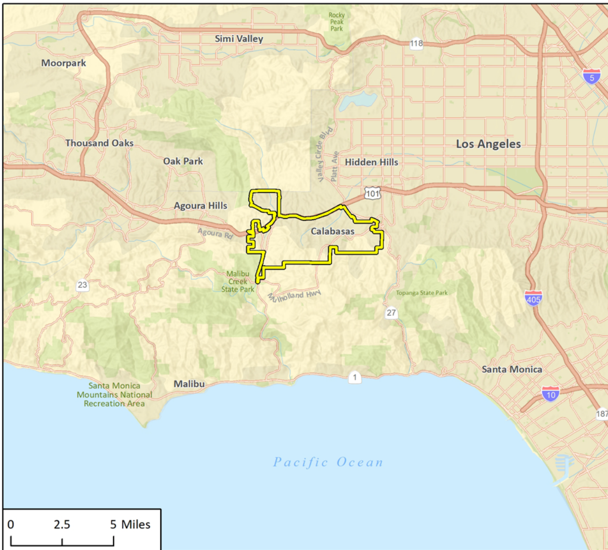
Figure 1 City of Calabasas Vicinity Map