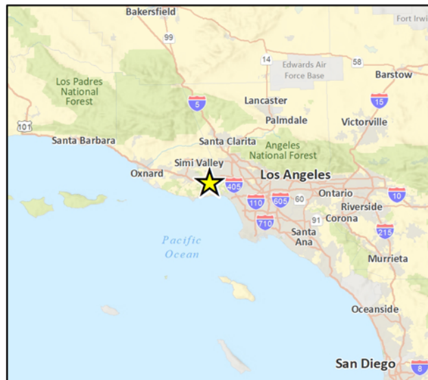
Fig 3 Regional Location