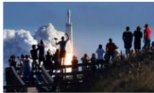
The Successful Launch of SpaceX Falcon Heavy

Though humankind always has been fascinated with the stars, planets, and outer space, technological innovations in the twentieth century enabled people to realize the dream of space exploration. Though still in its relative infancy, space travel has achieved many stunning accomplishments involving both cooperation and competition between different nations and their scientists since the 1950s. In addition to manned missions beyond Earth's atmosphere, to the Moon, and to space stations orbiting Earth, space agencies have acquired information through satellites, telescopes, and rovers that allowed the virtual exploration of planets in our solar system and outer space.