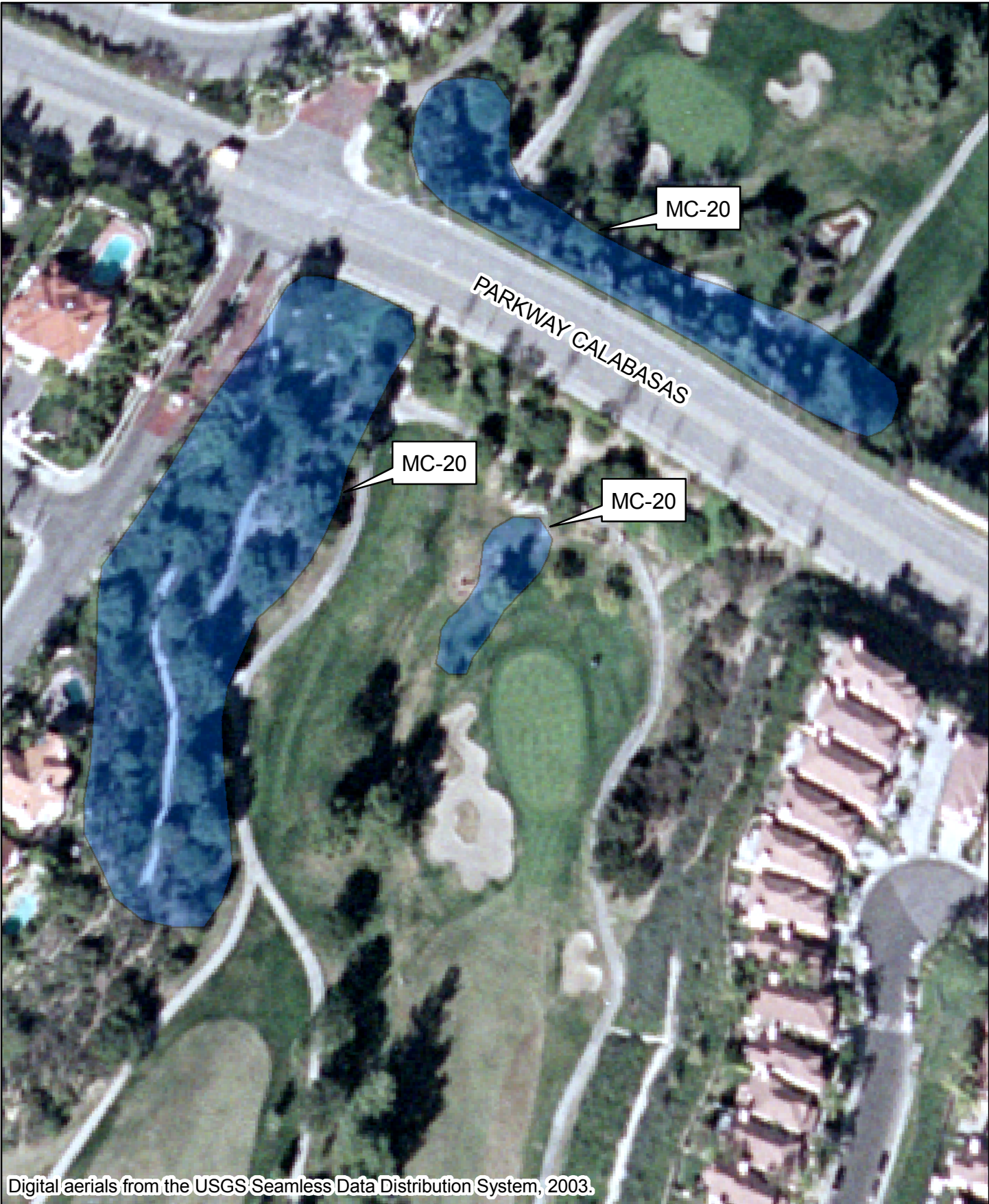
Digital aerials from the USGS Seamless Data Distribution System, 2003.