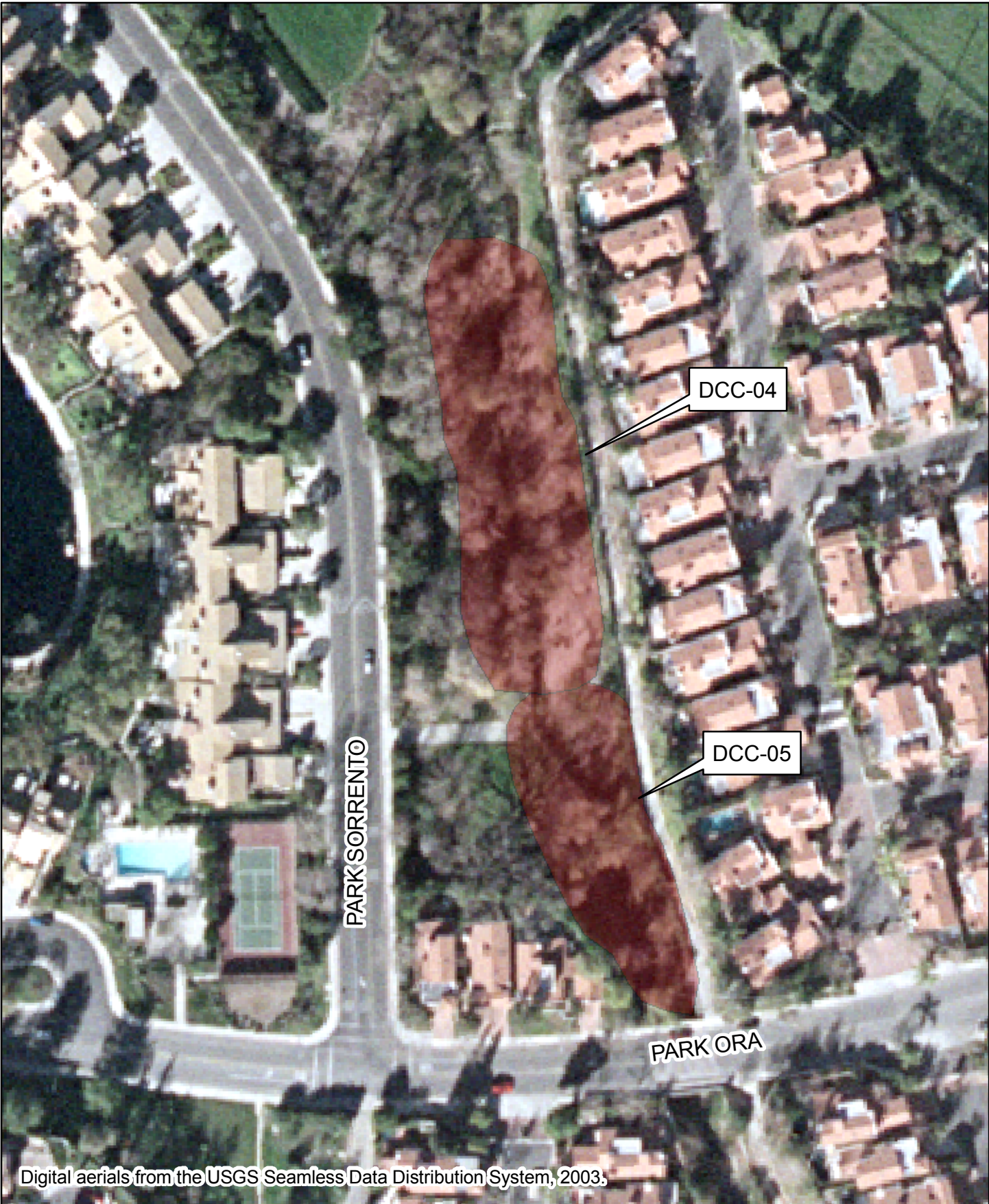
Digital aeriels from the USGS Seamless Data Distribution System, 2003.