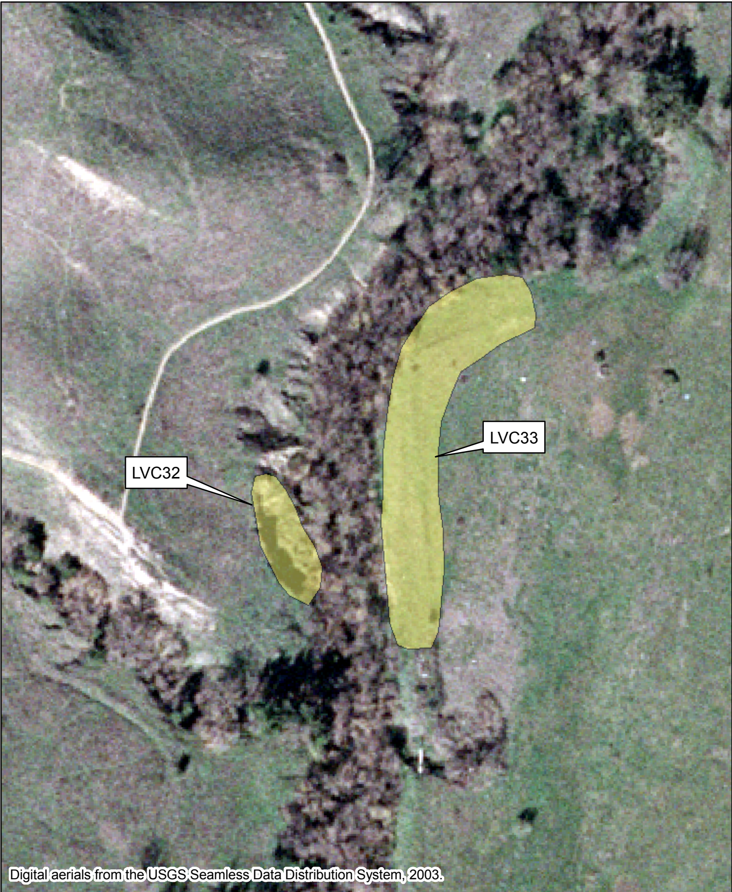
Digital aerials from the USGS Seamless Data Distribution System, 2003.