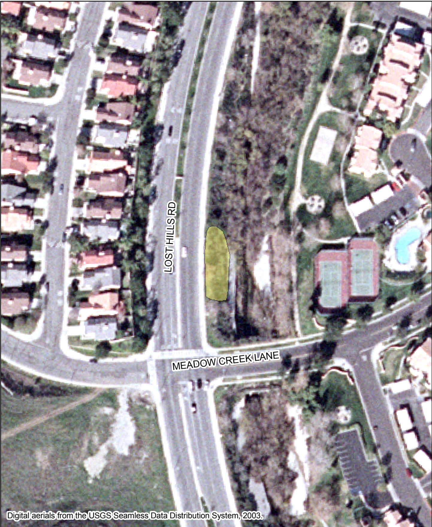
Digital aerials from the USGS Seamless Data Distribution System, 2003.