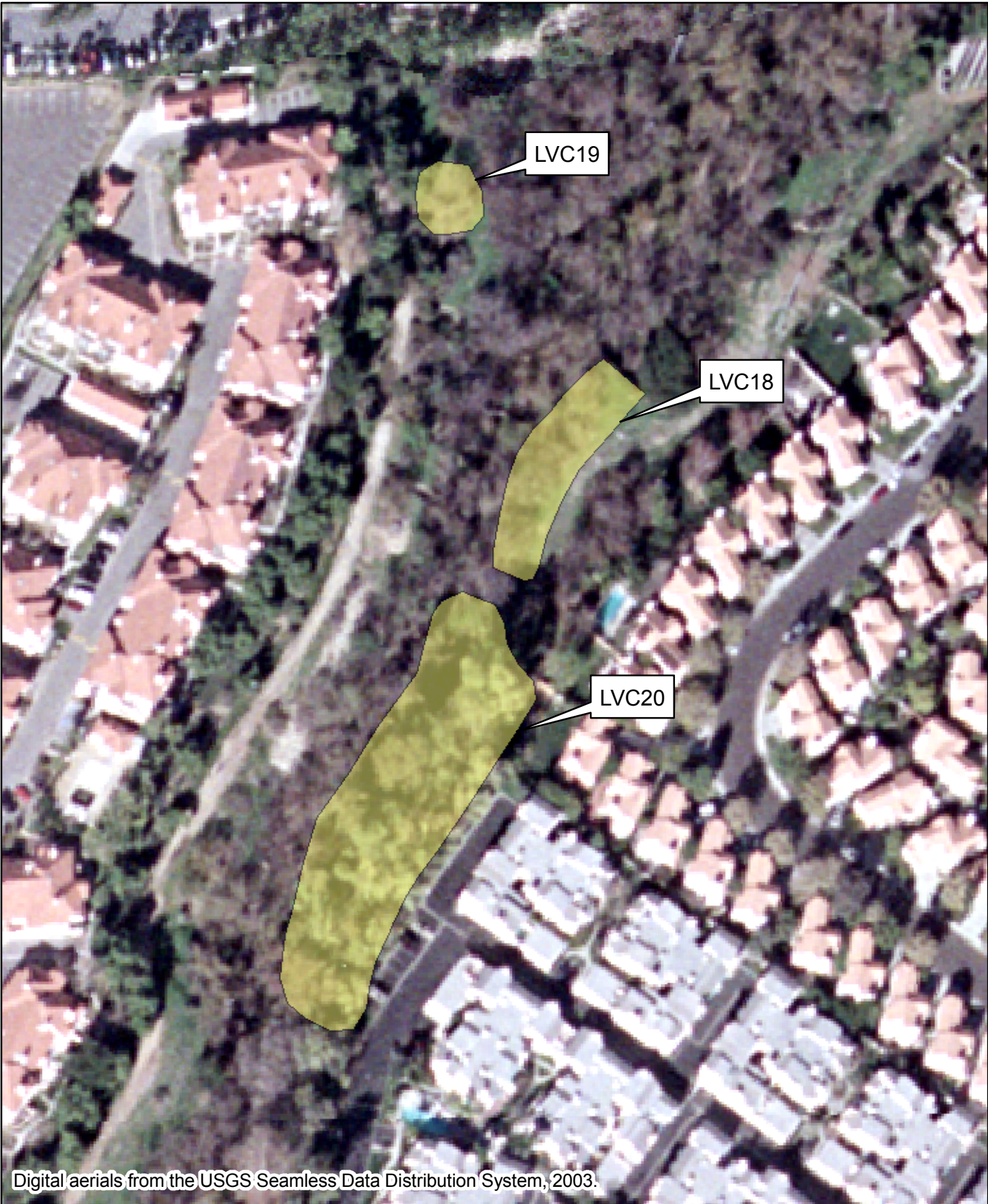
Digital aerials from the USGS Seamless Data Distribution System, 2003.