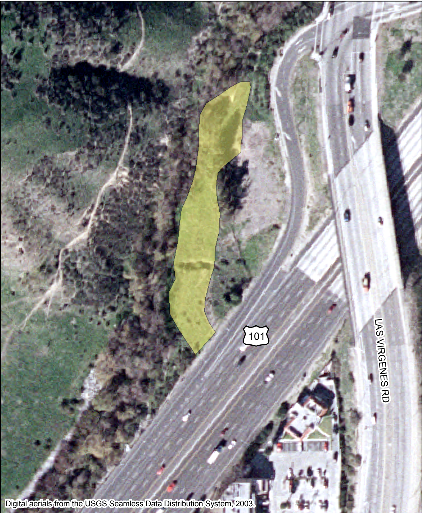
Digital aerials from the USGS Seamless Data Distribution System, 2003.