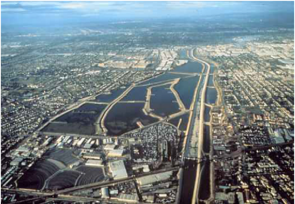
For over 35 years, in the Montebello Forebay Ground Water Recharge Project, recycled water has been applied to the Rio Hondo spreading grounds to recharge a potable ground water aquifer in south-central Los Angeles County.

While numerous successful ground water recharge projects have operated for many years, planned augmentation of surface water reservoirs has been less common. However, there are some existing projects and others in the planning stages. For example, since 1978, the upper Occoquan Sewage Authority has been discharging recycled water into a stream above Occoquan Reservoir, a potable water supply source