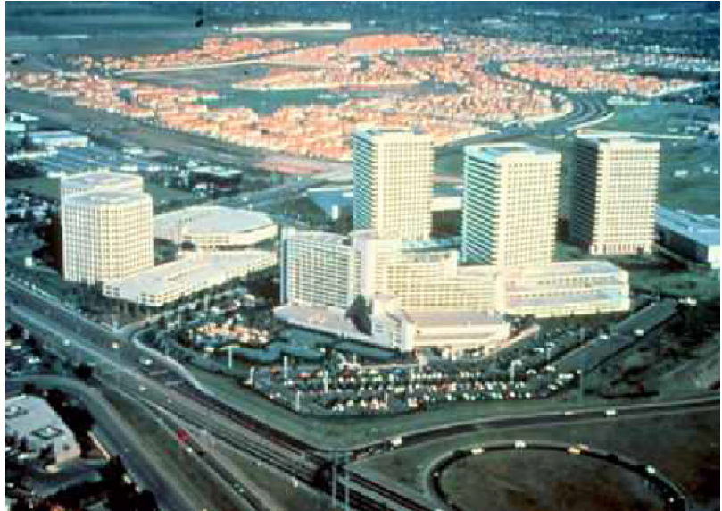
The Irvine Ranch Water District provides recycled water for toilet flushing in high rise buildings in Irvine, California. For new buildings over seven stories, the additional cost of providing a dual system added only 9% to the cost of plumbing.

Recycled water is most commonly used for nonpotable (not for drinking) purposes, such as agriculture, landscape, public parks, and golf course irrigation. Other non-potable applications include cooling water for power plants and oil refineries, industrial process water for such facilities as paper mills and carpet dyers, toilet flushing, dust control, construction activities, concrete mixing, and artificial lakes.