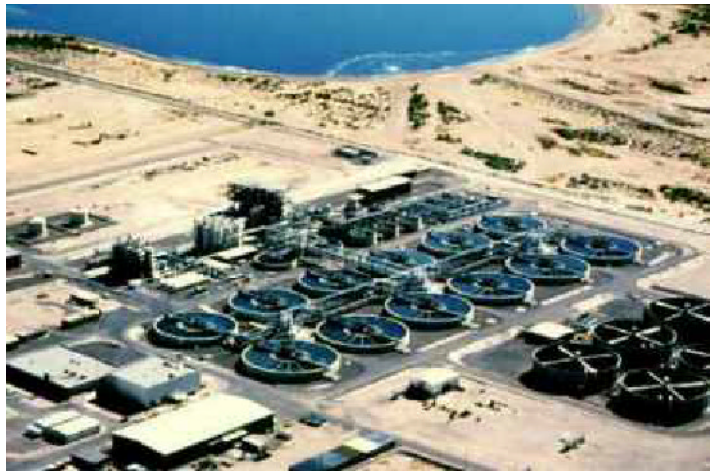
The Palo Verde Nuclear Generating Station, located near Phoenix Arizona, uses recycled water for cooling purposes.

Through the natural water cycle, the earth has recycled and reused water for millions of years. Water recycling, though, generally refers to projects that use technology to speed up these natural processes. Water recycling is often characterized as “unplanned” or “planned.” A common example of unplanned water recycling occurs when cities draw their water supplies from rivers, such as the Colorado River and the Mississippi River, that receive wastewater discharges upstream from those cities. Water from these rivers has been reused, treated, and piped into the water supply a number of times before the last downstream user withdraws the water. Planned projects are those that are developed with the goal of beneficially reusing a recycled water supply.