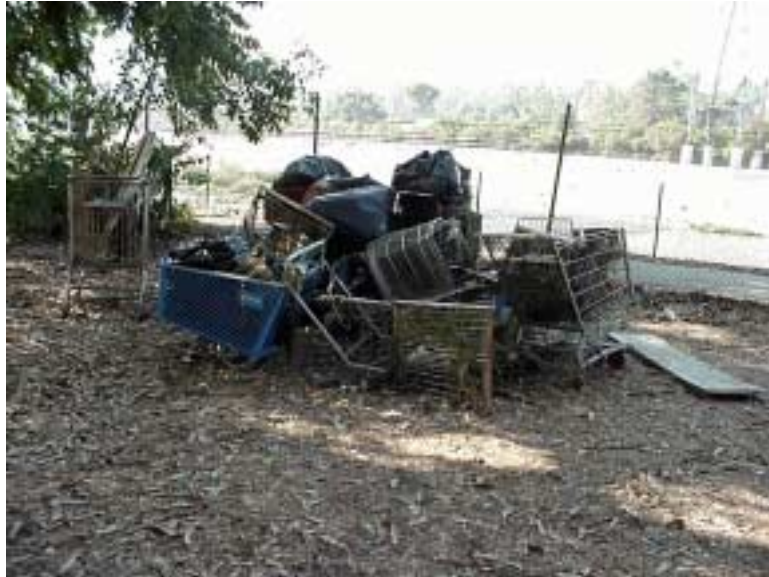
Figure C. Trash waiting for pick-up at Los Feliz Boulevard after the Sunday, October 16, 1999 river clean-up.

Several studies which attempted to quantify trash generated from discreet areas have been completed, but they concern relatively small areas, or relatively short periods, or both. The findings of some of these studies are discussed below.