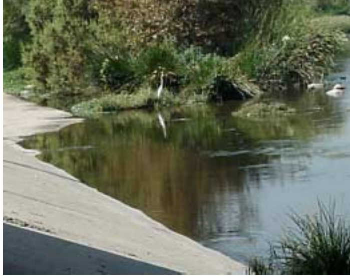
Figure B. Fletcher Drive: Great Egret, October 26, 1999.

From Figueroa Street to Washington Boulevard, the river supports several beneficial uses, including the Downtown Channel, which is used by many for recreation and bathing, in particular by homeless people who seek shelter there.